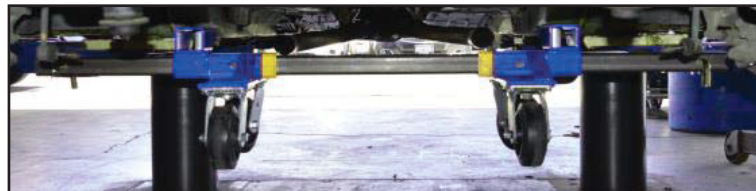
Wheels OUTBOARD mounting brackets