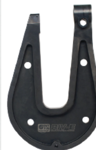
Large Arm DF-SPR/HRB-L