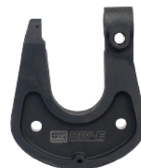
Medium Arm DF-SPR/HRB-M