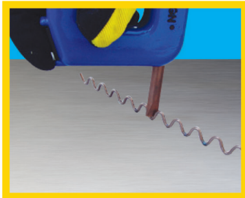
Wiggle Wire for Bear Claws